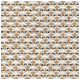
LATTE MILD 2114 300 NEW