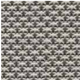
IRON MILD 2117 300 NEW