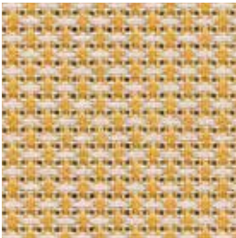
BEE MILD 2116 300 NEW