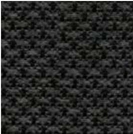
CHOUCAS MILD 2120 300 NEW