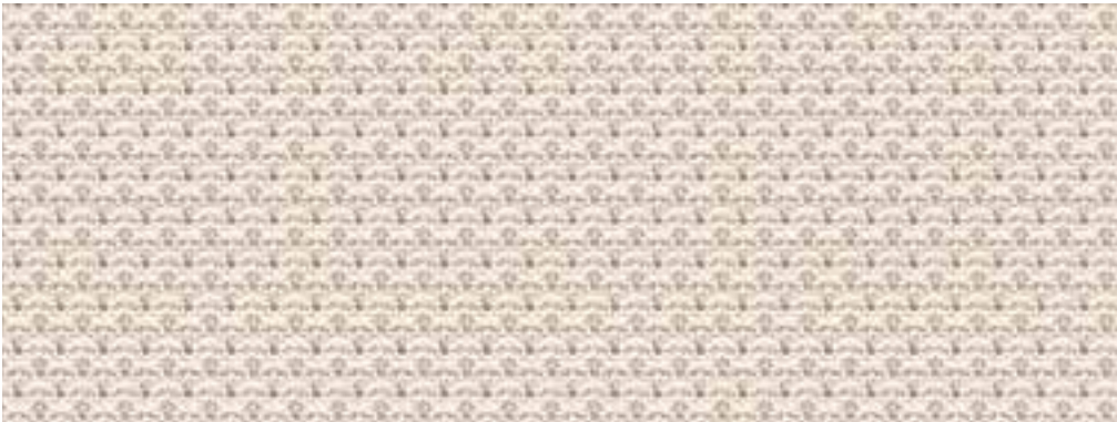
SAND MILD 2102 300