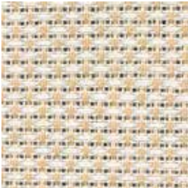
SHELL MILD 2113 300 NEW