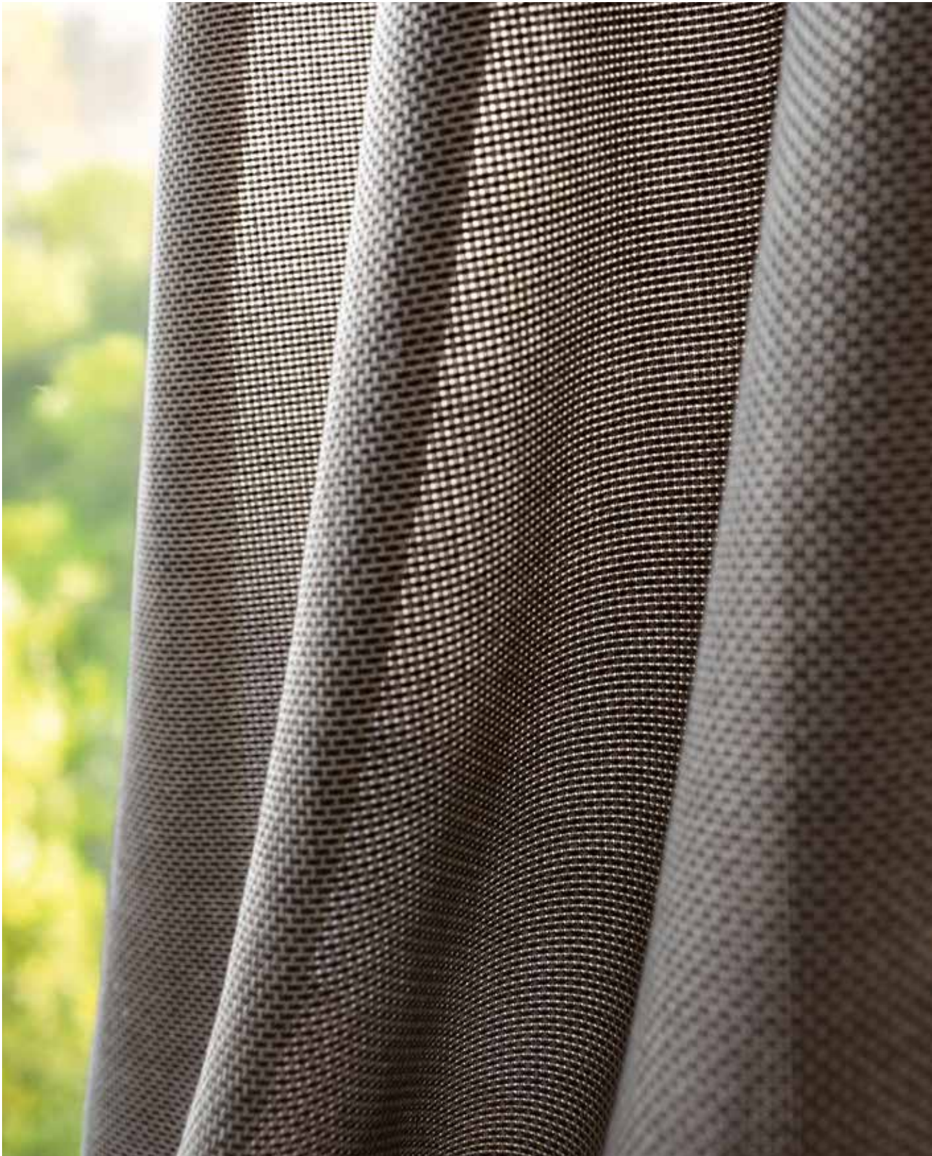
MILD URBAN 2118