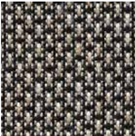
URBAN MILD 2118 300 NEW