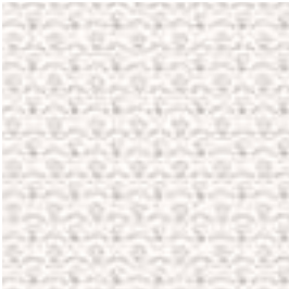
CHALK MILD 2101 300