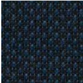
COVELINE MILD 2119 300 NEW